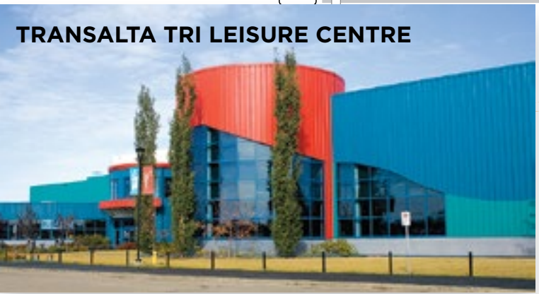
TRANSALTA TRI LEISURE CENTRE